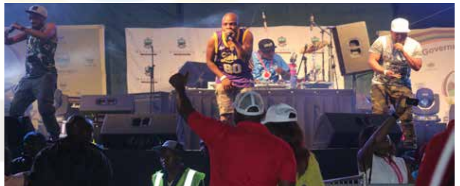
Ngasentla: ngu Professor ebetha adume ngazo

Uqhuba athi bakwavulele ithuba ukuba kuxhamle nosomashishini balaMmandla kuquka aba bashishina ngamagumbi obakhenkethi, abathengisi basezitalatweni, kunye nosomashishini abasakhasayo. Uqwele ngeliqinisekisa ukuba abo bajongene nomsebenzi wezandla bafumene ukuvelisa izakhono nono Khontraki basekuhlaleni bafumene lendyweba.