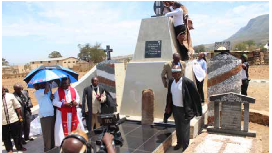
Ngasentla: kutyhikwa ilitye eNdzongiseni eMount Ayliff kukhunjulwa inkosi yaMaxesibe namakhosikazi akhe