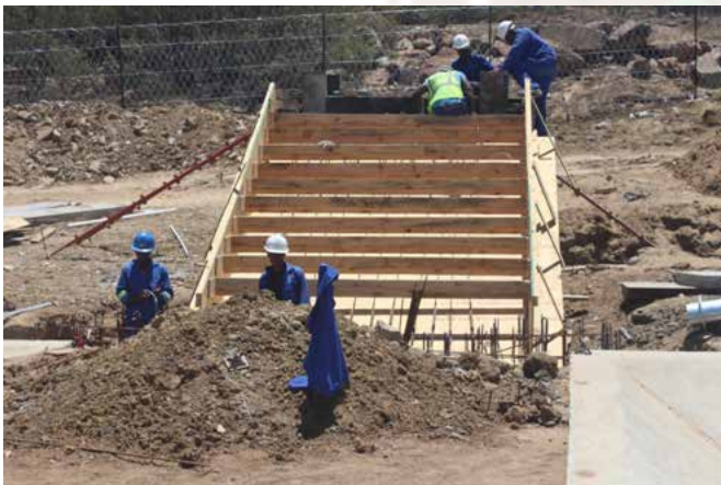
Ngasentla: indawo yokucocela amanzi kwindawo yaseFubane eMatatiele isalungiswa.