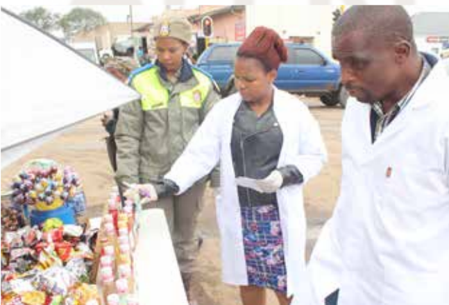
Ngasentla: abezempilo kumasipala baxwayisa uluntu kwiRenki yaseMbizana