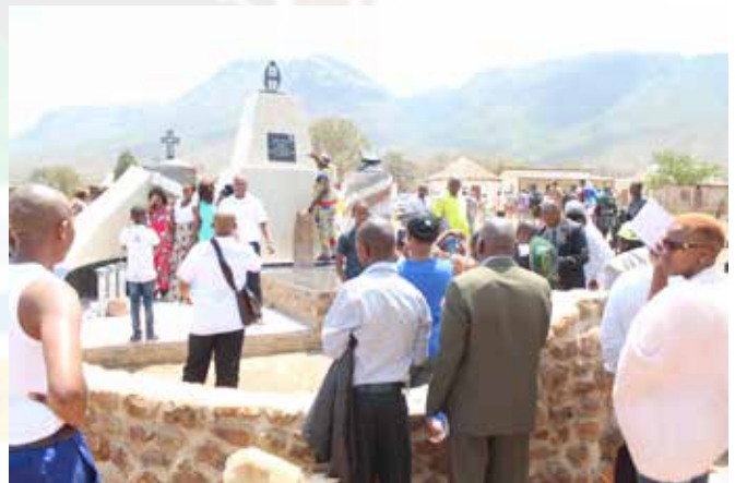
Ngasentla utyilo litye lwesikhumbuzo kwilali yaseNdzongiseni kwidolophu yaseMount Ayliff