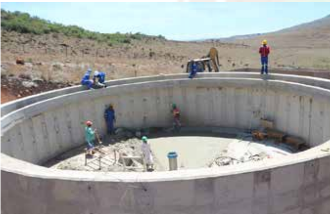
Ngasentla: indawo yokucocela amanzi kuNtabankulu iyaqhuba