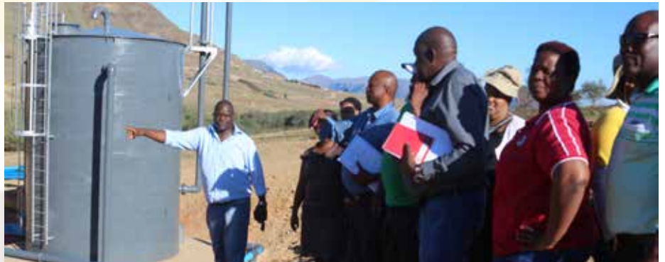
Ngasentla: sisigqeba sekomiti ejongene nophuhliso kwanenkcitho mali (MPAC) iyokuhlola kwiprojekti yamanzi eMount Frere

iMbizana, phakathi kwazo kuquka iiprojekti yamanzi ekwindawo yaku Nomlacu, kunye neeprojekti eziyongene nokuphuhlisa uluntu lwase Mfundisweni.