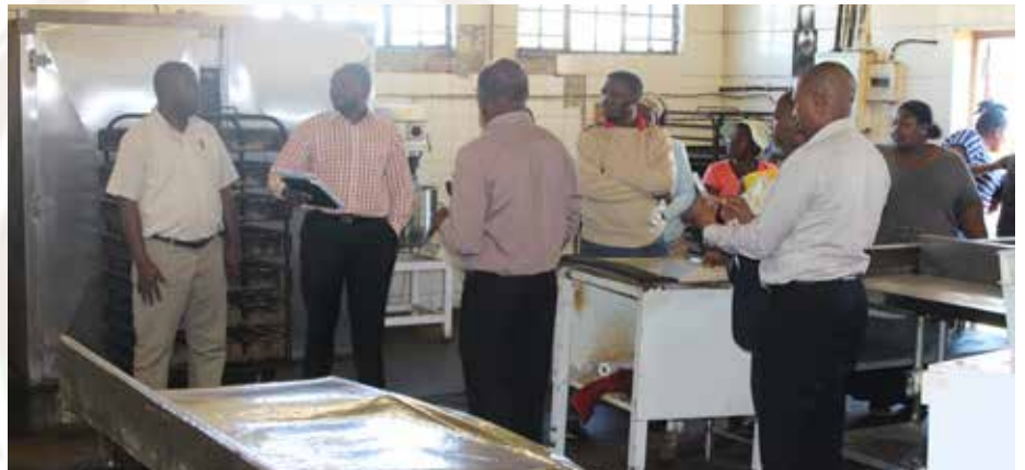
Ngasentla: ligqiza le MPAC libhala iiprojekti ejongene nokuvelisa amaqabengwane eMfundisweni, eNtabankulu