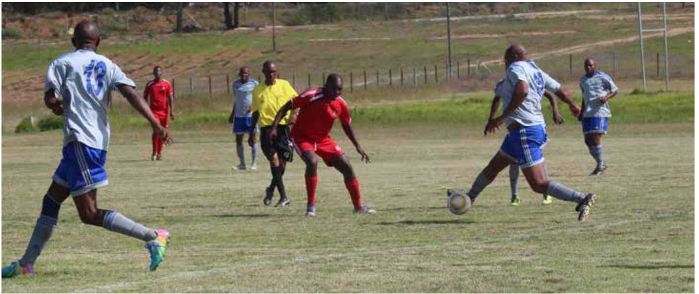
Ngasentla: liqela lebhola ekhatywayo lamagosa kamaipala noceba besenza abadume ngazo kukhuphiswano lwe SALGA ngo 2015

Oomasipala bephondo leMpumakoloni babuthelene kwidolophu encinane yase Alice kumasipala wesithili iAmathole ukuthatha inxaxheba kwimidlalo ebanjwa rhoqo ngonyaka ye SALGA, intlangano kazwelonke ejongene nokuphuhlisa koomasipala basekuhlaleni, le midlalo ifikelela kwityeli lesihlanu isingathwa yilentlangano yebhola.