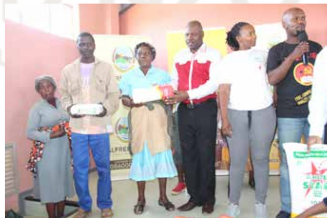
Ngasentla: usekela sodolophu unikezela ngokutya komnye wabahlali kwilali iMoyaneng ngosuku lamazwe likagawulayo