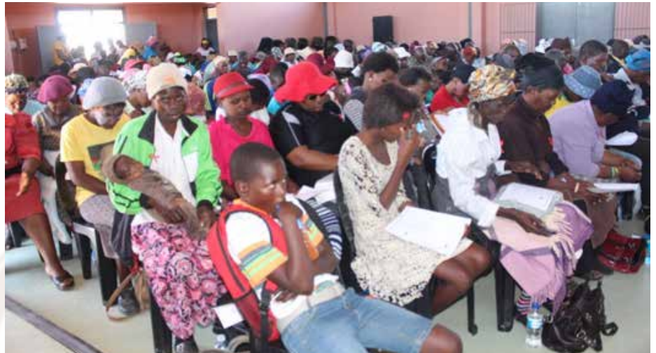
Ngasentla: abahlali bakaWard 16 baphulaphule ngombla weDistrict World Day

UMhla wokuqala kwinyanga yoMnga wathi wabekelwa bucala ukususela kunyaka ka 1987 njengomhla wokukhumbula esisifo, uRhulumente, amagosa ezempilo,