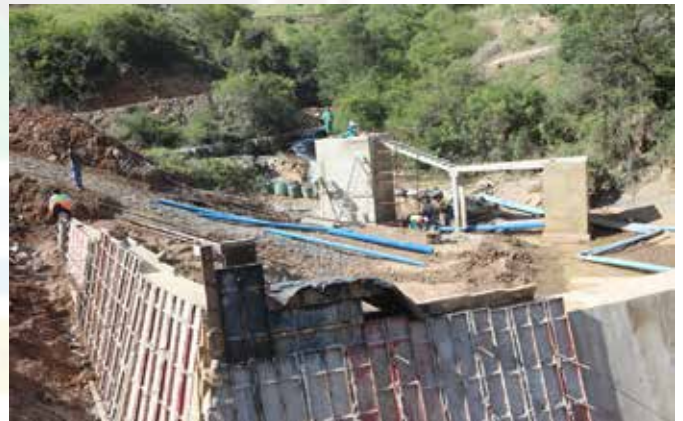
Ngasentla: iprojekthi iBomvini / Nyokweni kulendeleke ukuthi izise amanzi acocekile kubahlali baseNtabankulu