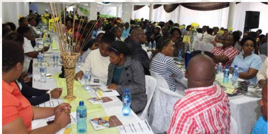
Ngasentla: abasebenzi badibene kwiigumbi lenkonfa ngomhla wabasebenzisi nkonzo.

kwihlabathi ngenjongo zokukhumbuzana ngokubaluleka kwabathengi kwanabo bajongene nokuhambisa iinkonzo kubathengi mihla le.Lombhiyozo