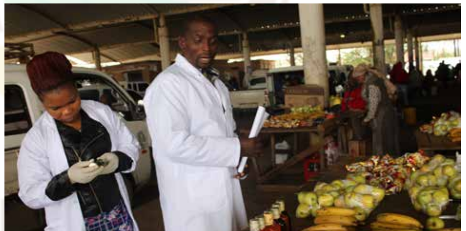
Ngasentla: yingcaphephe yezempilo ixhobisa abathengisi ngendlela yokubekwa kokutya abakuthengisayo

Oku kwenziwe emva kwamarhe athe ndii okuthengiswa kwezimveliso zinobungozi ngokusemthethweni, nangondlela