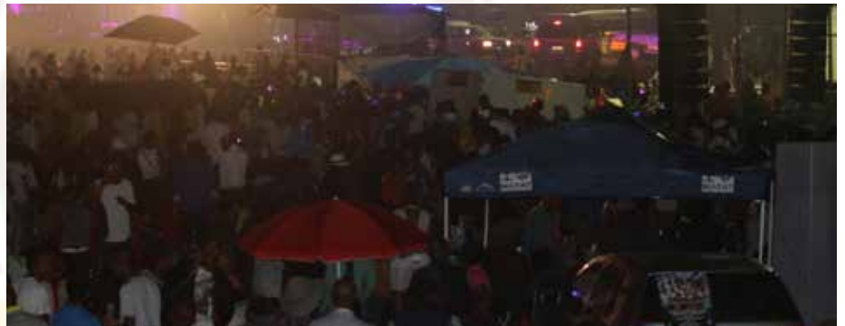
Izihlwele Zonwabele mmndyadala womculo