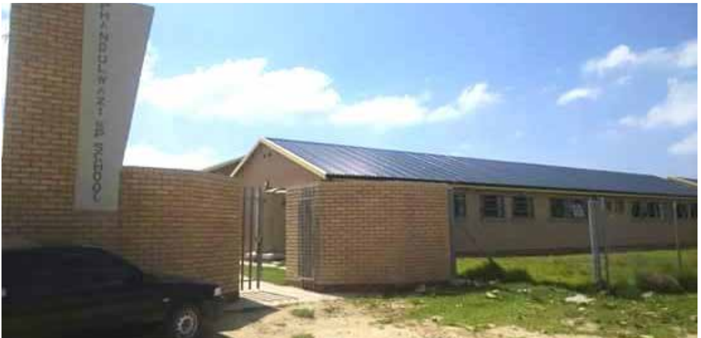
Ngasentla: sisikolo iPhandulwazi Senior Primary School

Babalelwa ngaphezulu kwamakhulu amahlanu abafundi abonwabele ukusebenzisa amagumbi amatsha okufundela njengoko isebe leMfundo likunye nomasipala wasekuhlaleni iMbizana livule ngokusesikweni isikolo samabanga aphantsi iPhandulwazi Senior Primary School, esakhiwe kwilali iMadiba eMbizana njengenxalenye yokuxhamlisa abantwana basemaphandleni kwimfundo esulungekileyo.