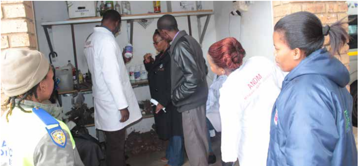
NGASENTLA: iingcaphephe kwezempilo zityelela oosomashishini base Mbizana

Emva kwesanxwe sokunyuka kwenani labantu abasebenzisa ipilisi zetanki nekuzingxelo eziphume kwisebe lezempilo kwiphondo le Mpumakoloni, ngokomlomo wesibhedlela iSt Patricks eMbizana, kunyanzeleke ukuba umasipala wesithili usabele ikhwelo lesisibhedlela ukukhawulelana nesisimbonono esebezisana nomahlakani kamasipala ngenjongo zokuxhobisa uluntu ngobungozi bokusetyenzoswa kwalamachiza.