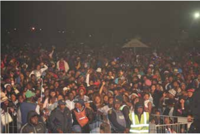
Ngasentla: abathandi bomculo abazekuzimasa iMatatiele Music festival