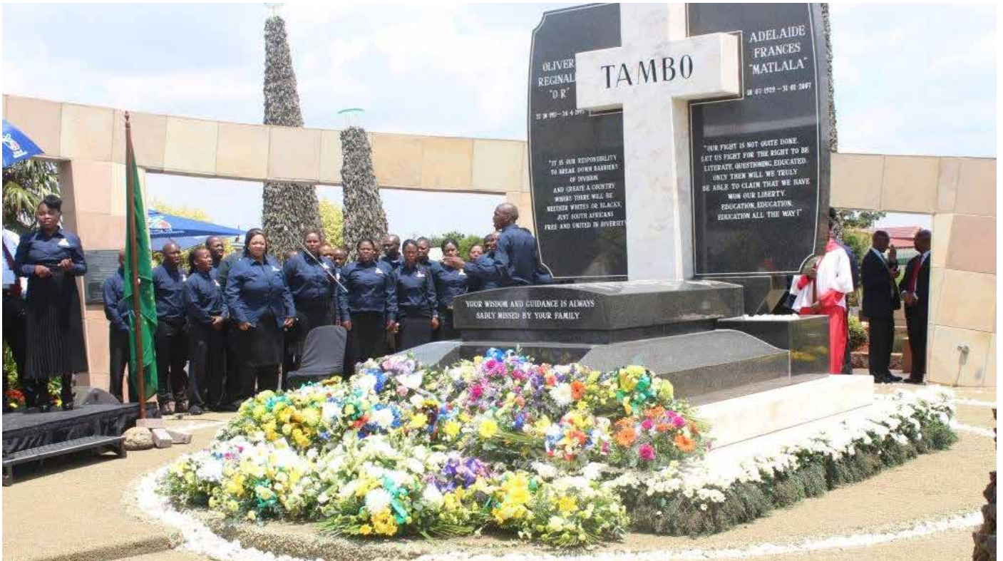
Above: O. R. and Adelaide Tambo's tombstone

Ziinkokhele ezohlukeneyo zopolitiko nezihlonipheki kuquka phakathi kwazo umongameli welizwe uJacob Zuma kunye nonkosikazi weqhawe elingasekhyo uNelson Mandela, uGraca Machel, ebezibuthelene kwindawo yase Wattville eBenoni, ngenjongo zokubhiyozela ubomi beenkokheli zeqela le ANC ezabonisa ukuzinikezela uOliver no Adelaide Tambo.