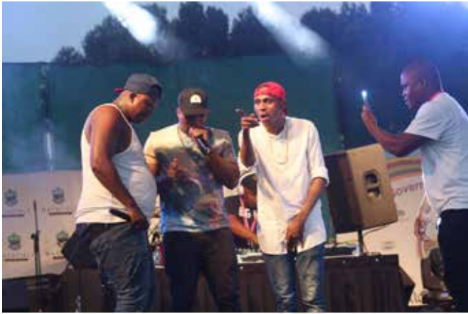
Ngasentla : iqela iBig Nuz lisonwabisa amaxhila omculo kwiMatatiele Music Festival