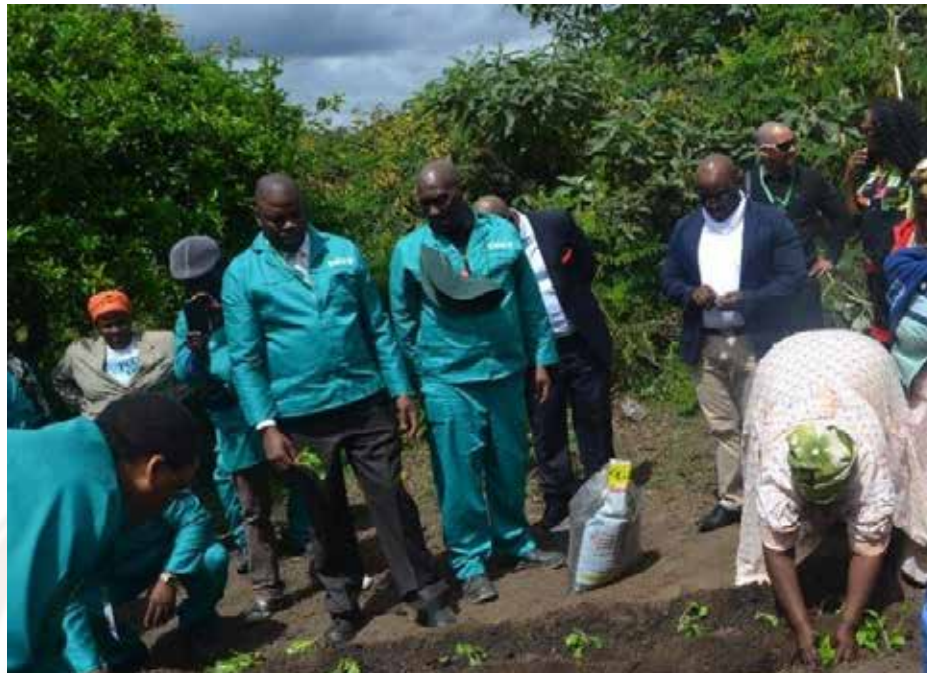
Ngasentla: sisikhokhelo sezopolitiko sityala kwezinye zezitiya eMbongweni eMbizana