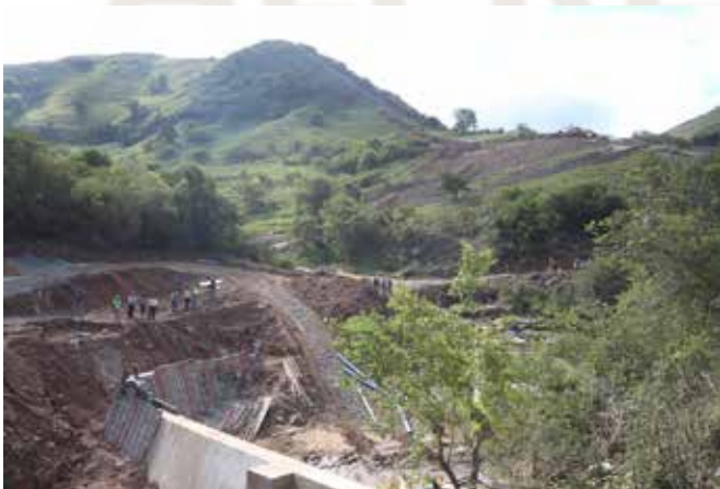
Ngasentla: iprojekthi yamanzi iBomvini/Nyokweni iyaghuba