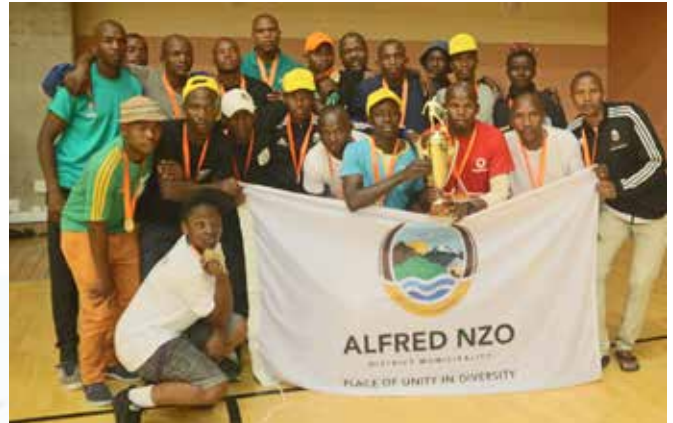
Ngasentla: iqela le bhola laseANDM liphethe indebe kwiMidlalo yeSALGA ebanjelwe eAlice