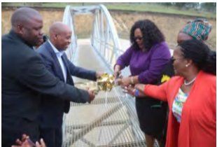
Multi-million rand Ludeke Dam launched in Mbizana