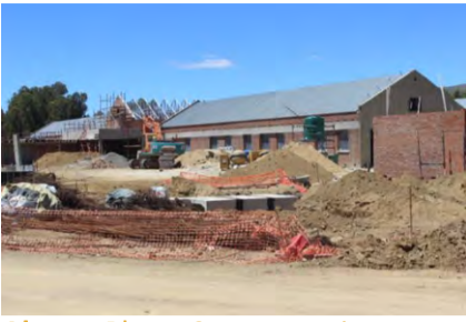
Above: Phase 3 construction at Khotsong TB Hospital in Matatiele.