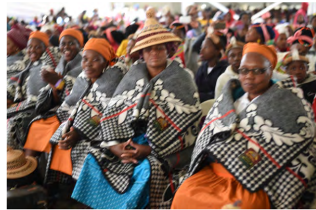
Above: communities at the O.R. Tambo centenary celebrations in Mbizana