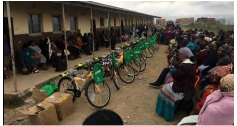
Above: Minister of Transport handing over bicycle at Nkanto-Lo Vilalge in Mbizana

The Minister distributed bicycles to learners at OR Tambo Technical High School as part of the Department's Shova Kalula programme. Shova Kalula is a learner transport programme which donates bicycles to learners who walk more than 3 km to school.