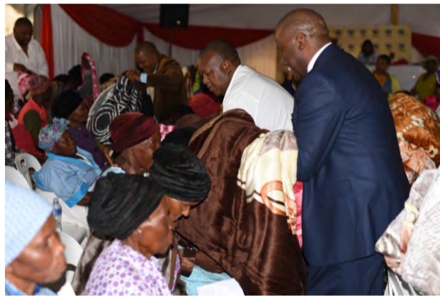
Above: Executive Mayor giving blankets to elderly at the closure of 16 days of Activism