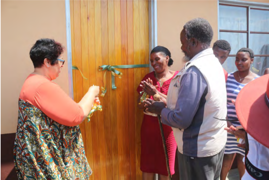
Above: M.E .C officially handing over a house to one of the beneficiaries at Silangwe Village in Mbizana just two days before the O.R Tambo centenary year celebrations