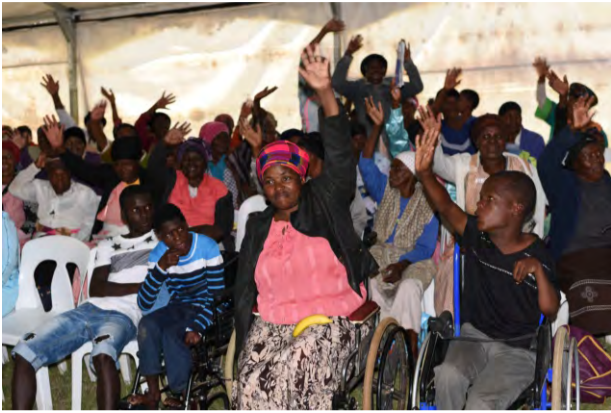
Above: Communities of Lubaleko Village celebrating during their events