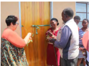
Silangwe Communities benefit in the name of Tambo