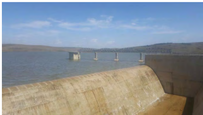
ABOVE: Ludeke dam which expected to supply communities of Alfred Nzo District Municipality

Department of water and sanitation launched a multi-million rand Ludeke Dam in Mount Zion, ward 26 in Mbizana. The launch was led by Minister Nomvula Mokonyane. Ludeke dam will increase the capacity of water treatment works and improve the bulk- water distribution in the district. Phase one of this project has been completed with the amount of R900 million and that includes building of the dam and now fully operational, pump raw water supply system to the existing water treatment works in Nomlacu village and upgraded into two phases.