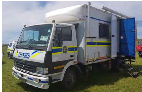
Above: mobile police station which was recently handed over by the MEC for transport in Mbizana