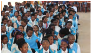
Matric prayer day session 2017