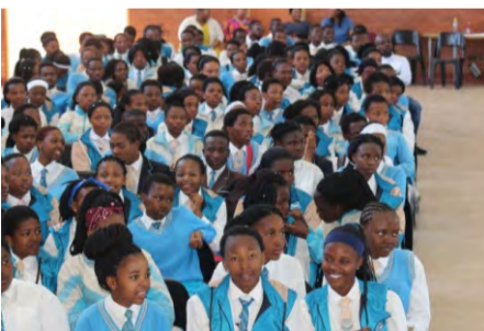
Above: Learners that attended Matric Prayer Session in Maluti Civic Centre

"In the past years we have also created supporting environment in the post school arena. These opportunities include the expansion of the opportunities for training in technical vocational and training colleges as well as at universities," he said.