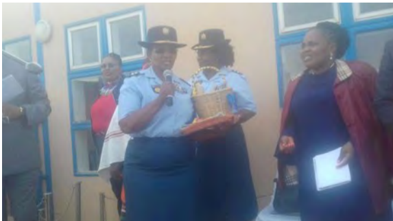
Above: M.E. C for Transport, safety & liaison at the official handover of mobile police station

On the same day, seven bakkies were handed over to the Mount Ayliff cluster which includes Mbizana. Cluster Commander Mthuthuzeli Mtukushe welcomed the mobile unit and the bakkies and assured their efficient use. "We welcome and we are thankful for these added resources; we promise to use them effectively and efficiently for the safety of our communities," said Mtukushe