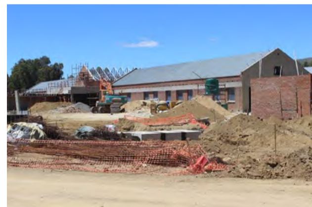
Above : Phase 3 construction at Khotsong TB Hospital