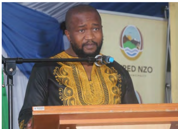
Left: Hon Mayor of Matatiele Local Municipality encourages Matriculants before writing their final

Grade 12 pupils in Matatiele were touched by words and prayer as Matatiele Local Municipality in partnership with Alfred Nzo District Municipality and the Department of Education held a Matric Prayer Day at Maluti Civic Centre in Matatiele.