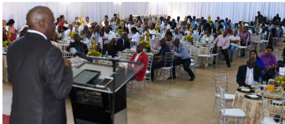
Above: Executive Mayor addressing parents and learners at the Awards