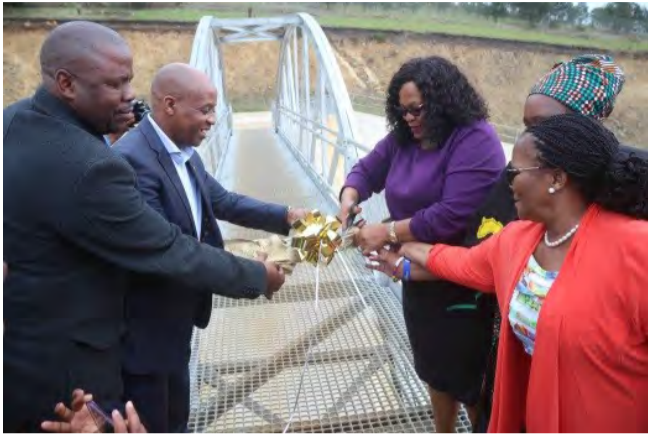
ABOVE: Executive Mayor of Alfred Nzo, Cllr. Sixolile Mehlomakhulu, Premier of the Eastern Cape, Phumulo Masualle, Minister of Water & Sanitation cutting the ribbon during launch of Ludeke dam.