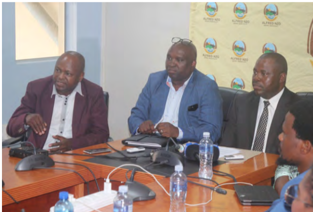
Above: Alfred Nzo District Municipality Mayoral and Management at the Media engagement interacting with journalists