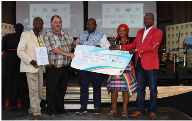
Above: King Edward High receiving cheque and trophies at the Matric Awards