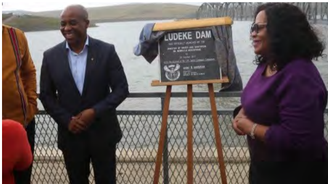
ABOVE: Premier Phumulo Masualle and Minister Nomvula Mokonye un-veiling the plaque of Lu-deke Dam.