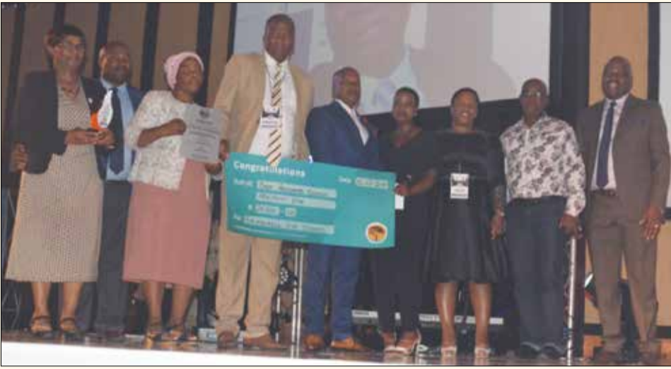
>> Above: Senyukele Senior Secondary school awarded a cheque worth R 20 000 as the best preferred school during the Awards