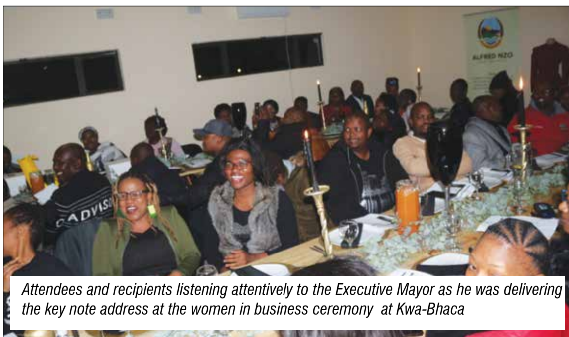
Attendees and recipients listening attentively to the Executive Mayor as he was delivering the key note address at the women in business ceremony at Kwa-Bhaca

Alfred Nzo District Municipality handed over tools of trade to women in business at the ceremony that was organised to honour and encourage excellence to women in business. The event was held at Tapi River Lodge Kwa Bhaca.