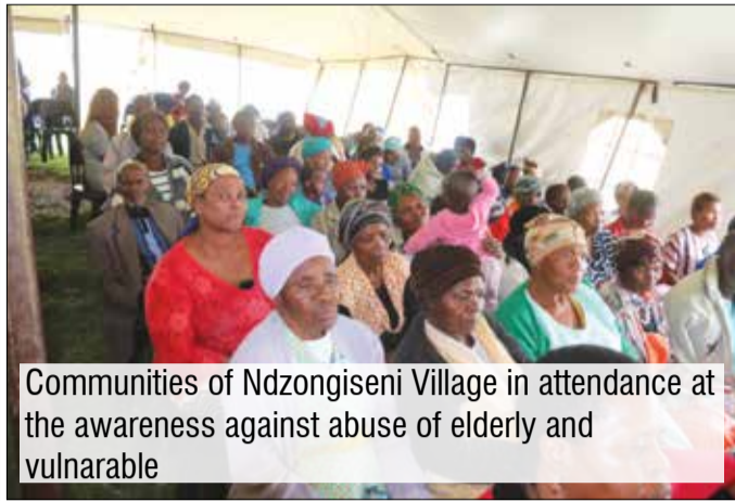
Communities of Ndzongiseni Village in attendance at the awareness against abuse of elderly and vulnerable