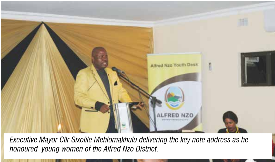
Executive Mayor Cllr Sixolile Mehlomakhulu delivering the key note address as he honoured young women of the Alfred Nzo District.