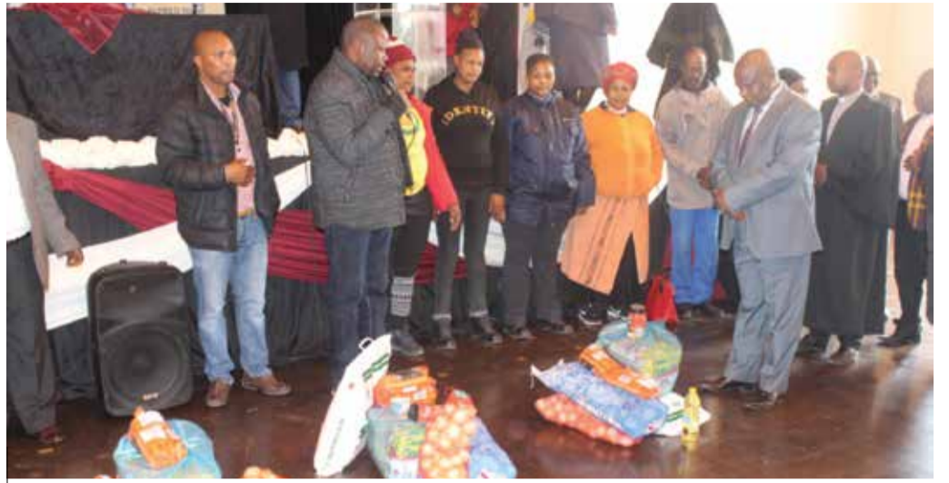
Above: Executive Mayor Cllr Sixolile Mehlo makhulu and provincial leadership handing over food parcels to the needy during the visit of member of the executive Committee (MEC) honourable Fikile Xasa

The economy of KwaBhaca gets a boost and expected to lure external investors as Umzimvubu Local Municipality implements town revitalisation and building new municipal complex offices in KwaBhaca. This was unveiled by MEC for Corporate Governance and Traditional Affairs