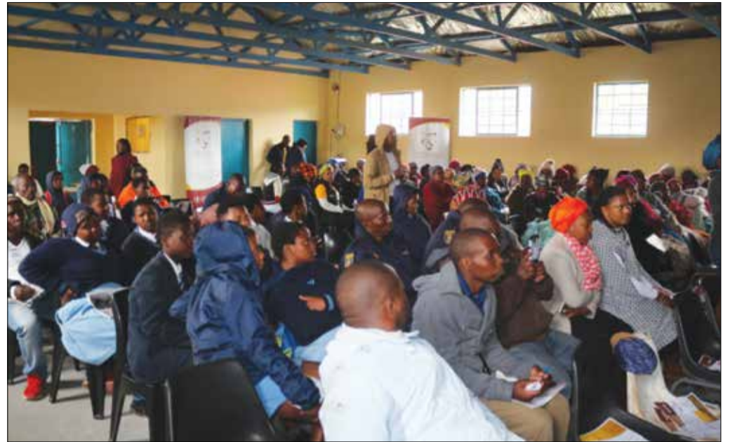
Above: Communities of Rhode Village listening attentively to liquor board representative during the roadshow

The Eastern Cape liquor board is busy embarking on Imbizo as part of their mandate to regulate liquor trading in the province in order to improve the image of this industry. The liquor board landed in the Alfred Nzo District at Rhode village ward 11 in the Umzimvubu local municipality. The road show seeks to educate community, particularly young people about dangers of excessive