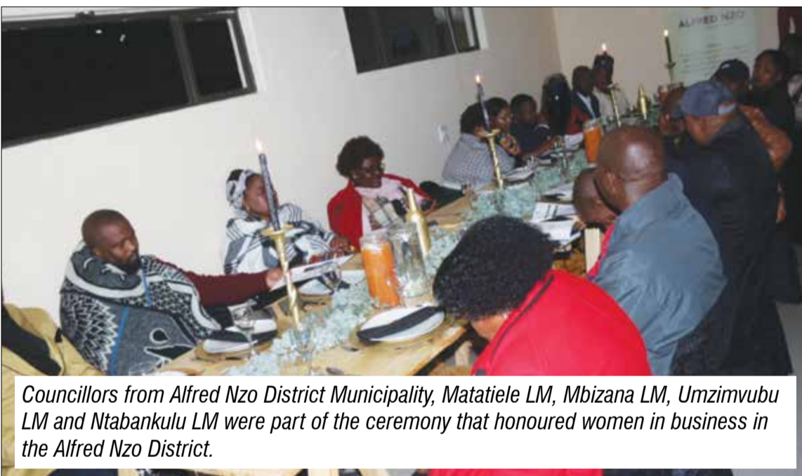
Councillors from Alfred Nzo District Municipality, Matatiele LM, Mbizana LM, Umzimvubu LM and Ntabankulu LM were part of the ceremony that honoured women in business in the Alfred Nzo District.