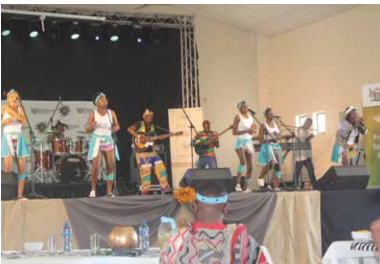
Above: Local groups within the Alfred Nzo District showcasing what they are capable of at the Maskandi festival kwaBhaca