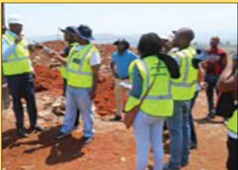
Above: Exec Mayor, S. Mehlomakhulu doing interviews during media tour in Mbizana