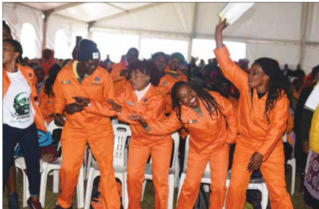
Above: EPWP beneficiaries singing and dancing at the Expanded Public Works Luanch at Mandizkane memorial park in KwaBhaca