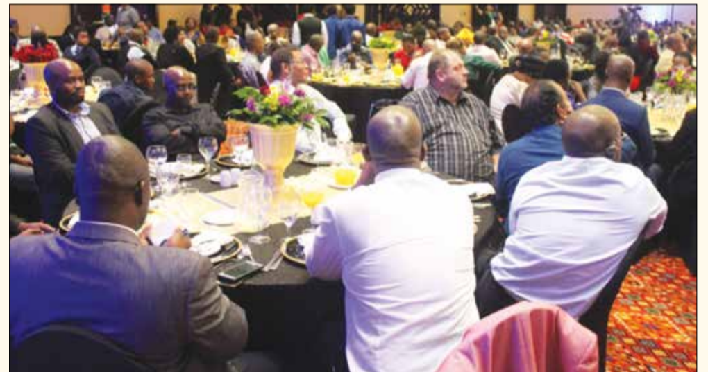
Above: 3rd Annual Alfred Nzo mayoral achievers awards attended by councillors from Mbizana, Ntabankulu, Matatiele and Umzimvubu local Municipalities, manager from sector departments, department of education representatives and learners.