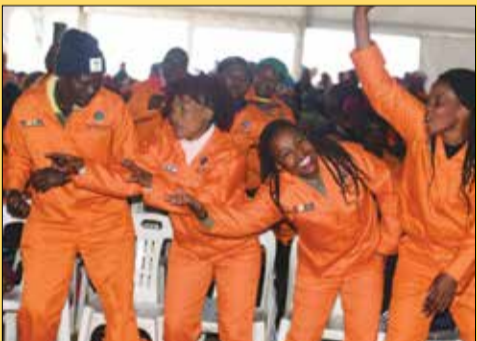
Above: EPWP workers during their launch in Kwa Bhaca