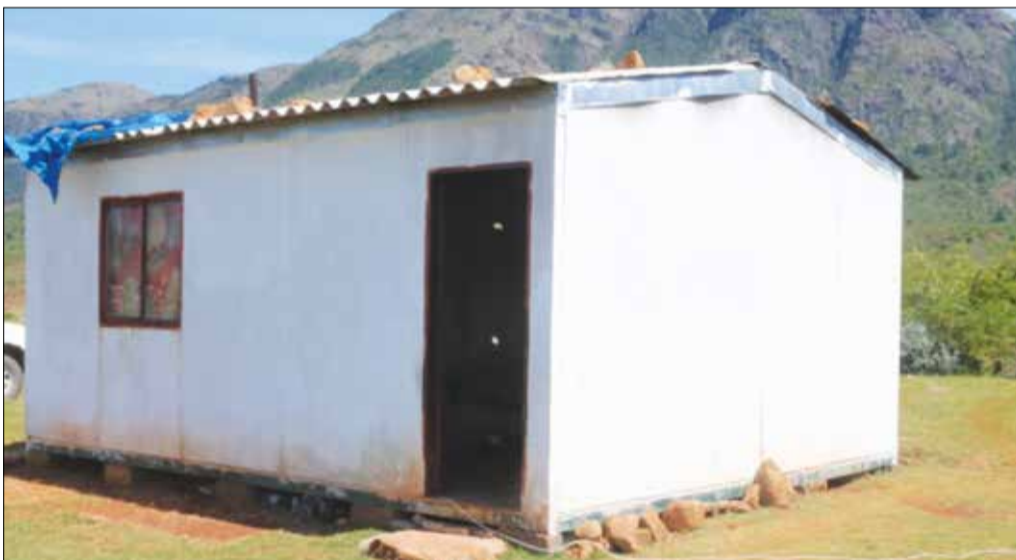
Above: temporary structure where an 86 year old Ncediswa Ndawule has been living in for the past 10 years