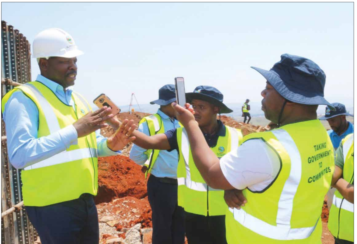
Above: Executive Mayor of Alfred Nzo District Municipality, Hon Sixolile Mehlomakhulu on a media tour to service delivery sites with local media houses within the district.

“A District whose communities are self-sustaining and enjoy a good quality life, equitable access to basic services and socio-economic opportunities.”