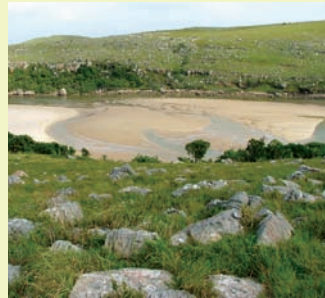
Pondo-Villager Hiking Trail

Look out for the numerous waterfalls, estuaries, caves with San rock art, sandy, unspoiled beaches (Mnyameni, Mzamba, Mtentu, Mpahlana), red sand dunes, and an abundance of wildlife, including over 200 species of mammal, including the red bush squirrel, the four-toed elephant shrew and the giant golden mole, which are endemic to the area.