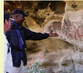
Discover Ancient Rock Art