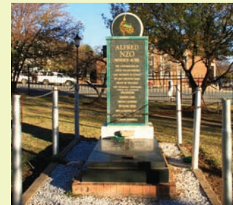
The Matatiele Heroes Acre