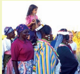
Home to the Pondon nation

The stretch of coastline between the Wild Coast Sun resort and the Mzamba River to the south is known as the Petrified Forest and is a set of famous marine fossil beds, in a 10 metre-high cliff. Officially known as the Mzamba Cretaceous Deposits, these date back some 80 million years.