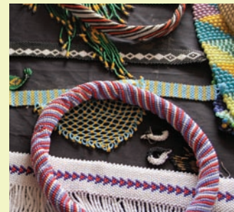
Traditional arts & crafts