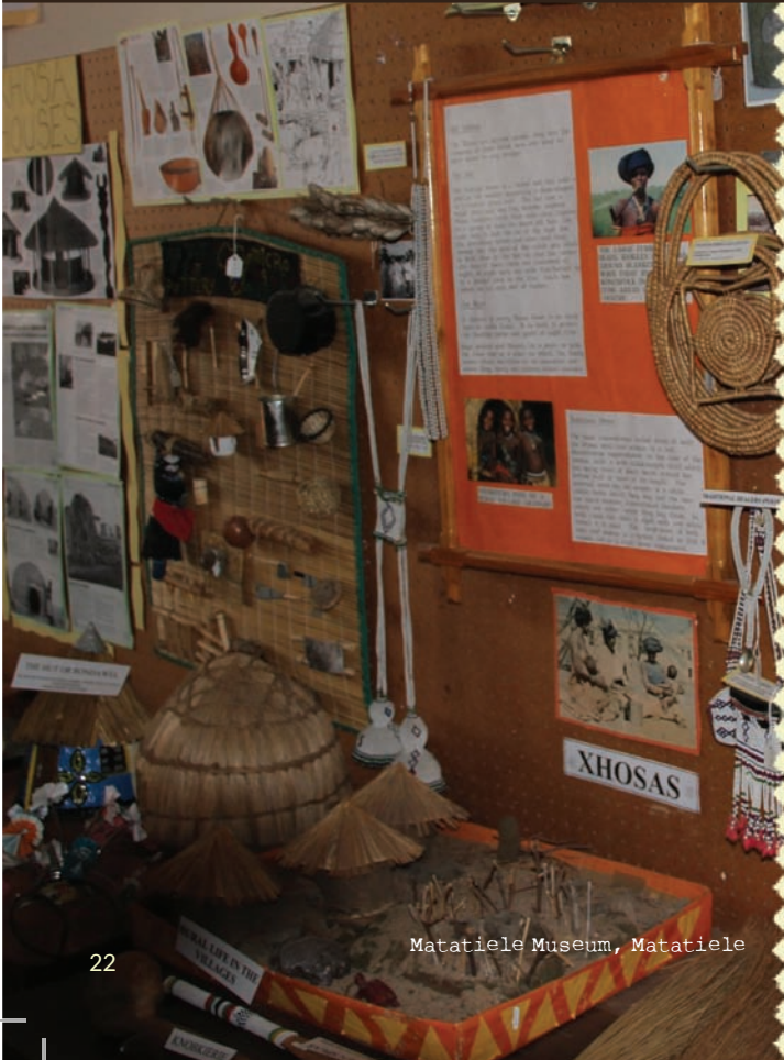
Matatiele Museum, Matatiele

The Matatiele Heroes Acre was built in memory of the many fallen heroes who passed away during the struggle era. Many of the victims' bodies were exhumed from countries like Lesotho and Botswana and buried in South Africa.