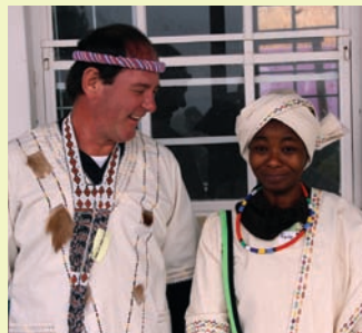
Try on traditional clothing

Meet the locals in Cultural Villages, Mzimvubu region