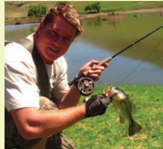
Enjoy Bass or Trout fishing

If you enjoy fishing, you've come to the right place. Many rivers offer wild trout fishing and some dams in the area are stocked with both rainbow and brown trout.