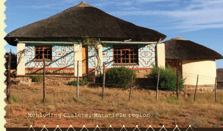
Mehloding Chalets, Matatiele region

For more accommodation information, contact the Umzimvubu Municipality on 039 255 0959 (Mount Frere) or 039 254 6000 (Mount Ayliff). Or during your visit to East Griqualand, contact the Matatiele Municipality on 039 737 3135.